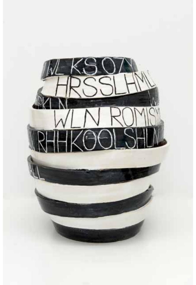
Fabian Marti, WLKSOZYDRTLHLNNLOIYM (All is All) , 2014 Glaze, clay 45 x 34 x 36 cm