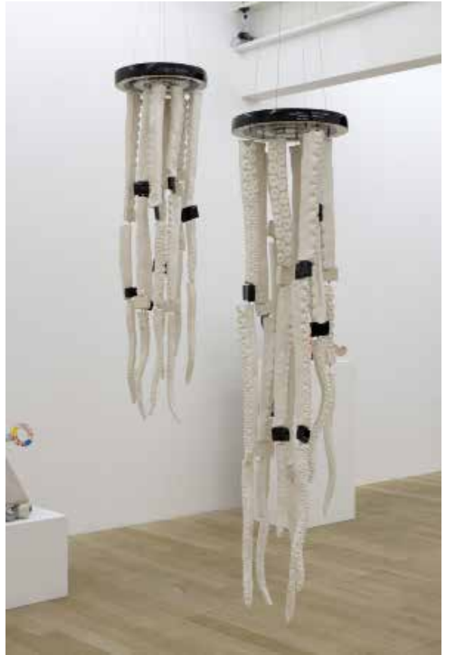
Exhibition views: "Zurich & elsewhere", Gallery Carlos/Ishikawa, London, 2015