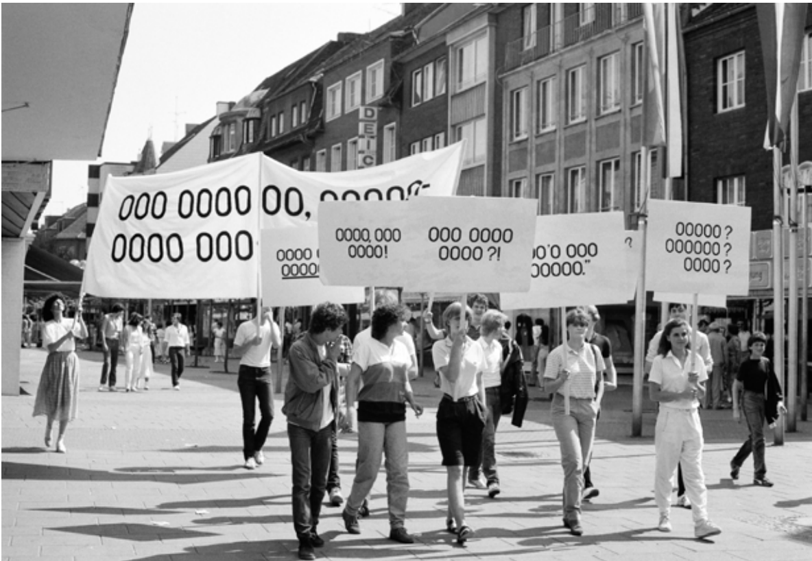
Zero Demo , Viersen, 1980