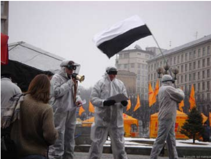
R.E.P. party , 2006 4 min Action, Kiev