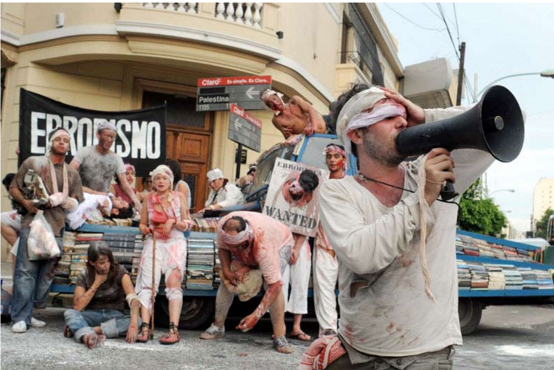
Urban Errorist Cartography, 2009 Video; 5 min