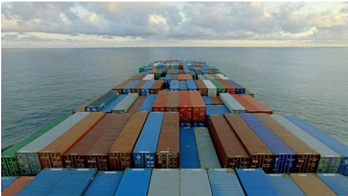
The ForgottenSpace , 2010 Videostill, 112 min Special price of the jury 2010 to Orizzonti Competition, Venice biennial Courtesy Allan Sekula & Noël Burch, galerie Michel Rein, Les Films des Deux Rives