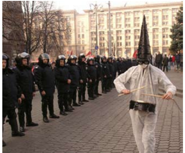
We will R.E.P. you !, 2005 11 min. Action, Kiev