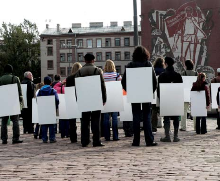
Angry Sandwich People , 2006 Video