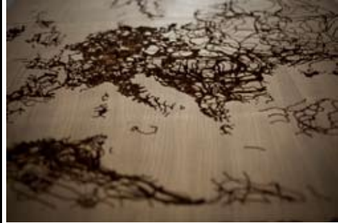
Spectral Aerosion, 2010-2011