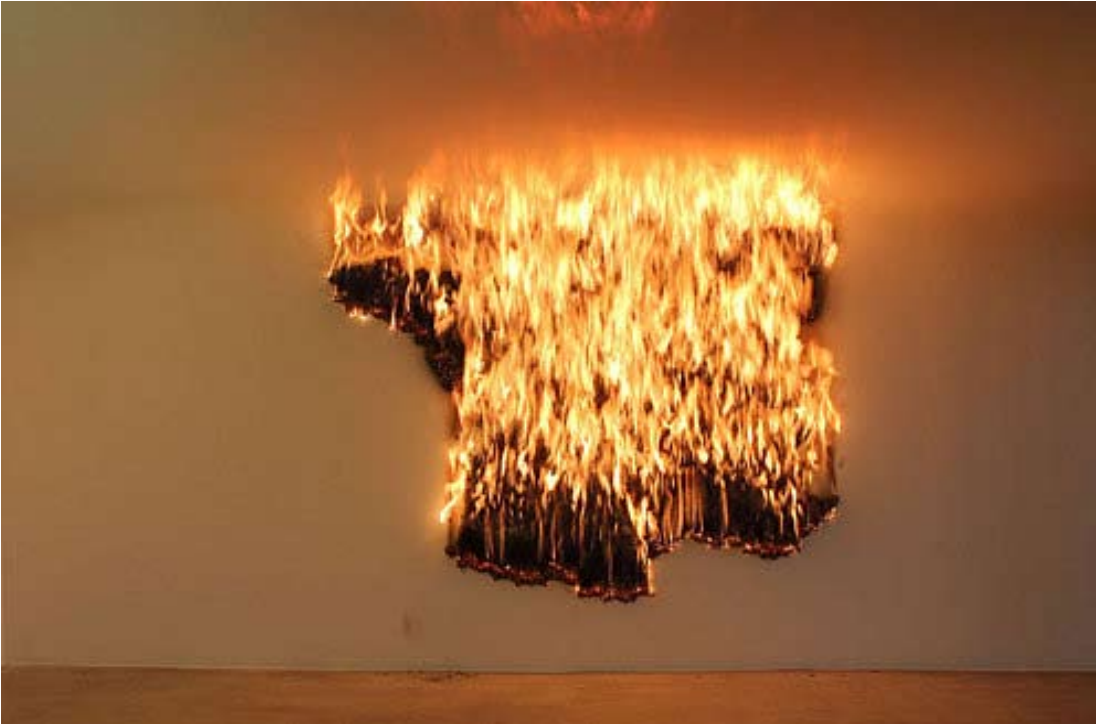
France (burnt/unburnt), 2011