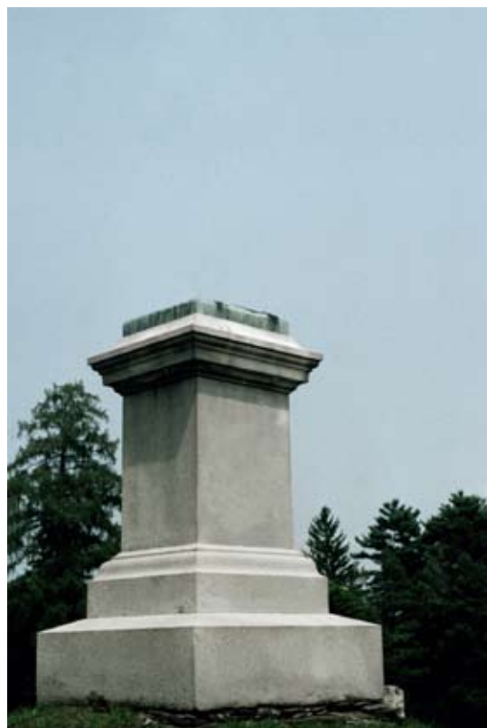
Peggy Buth, Found Footage (Monument) , 2007