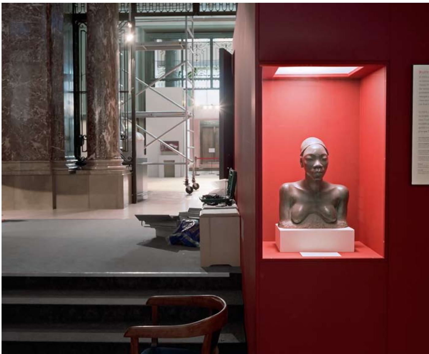
Peggy Buth, Desire in Representation , 2004–2009 Series of 70 photographs