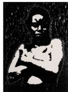
Peggy Buth, Desire in Representation , 2004–2009 Series of 70 photographs Courtesy : Peggy Buth