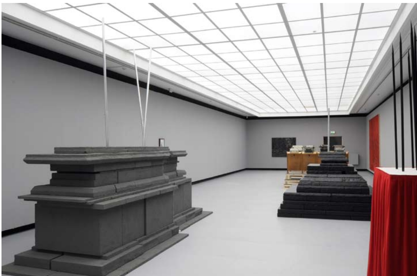
Peggy Buth, Desire in Representation , 2009 Württembergischer Kunstverein, Stuttgart Exhibition view © by Peggy Buth and KLEMMS, Berlin