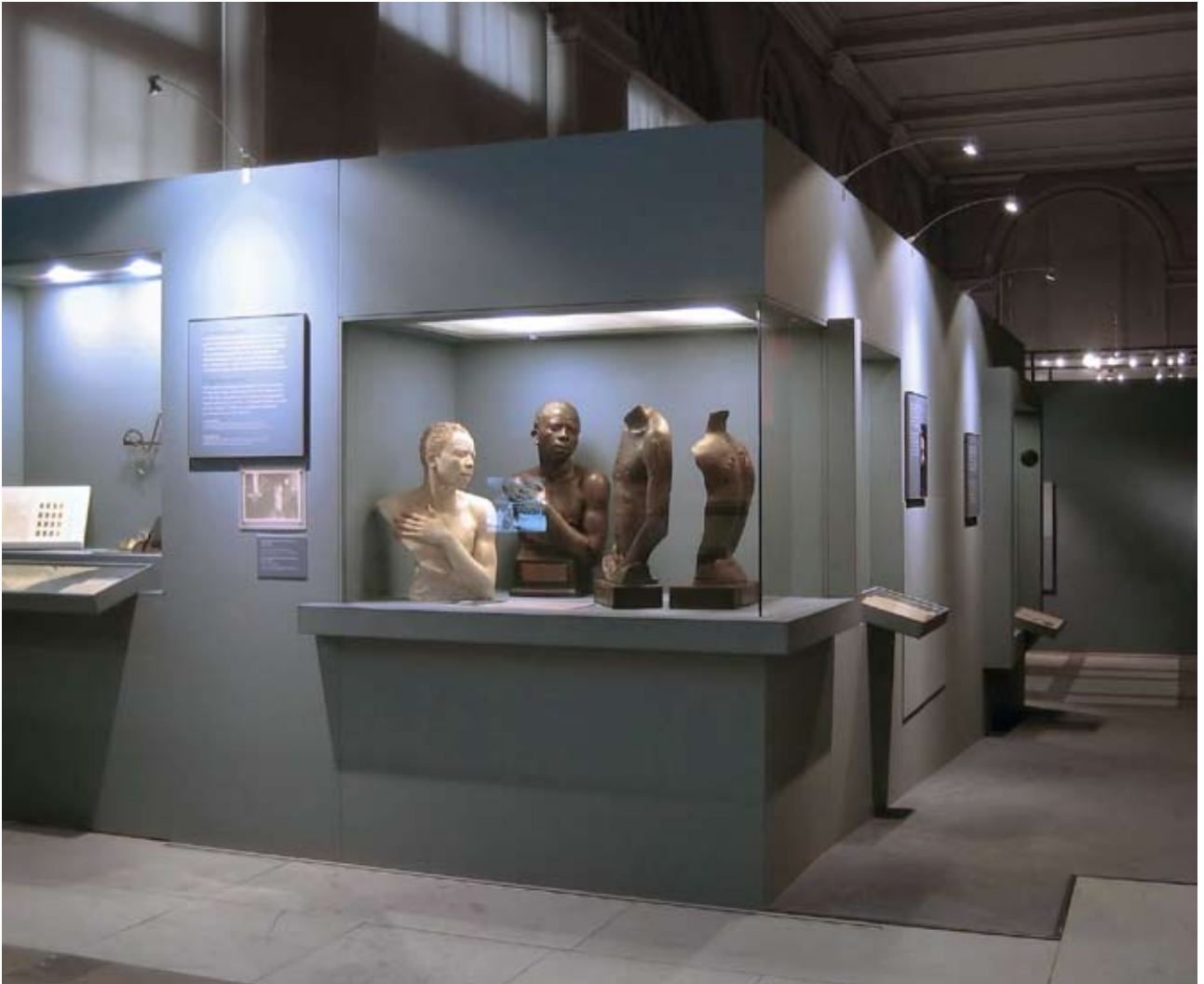
Peggy Buth, Desire in Representation , 2004–2009 Series of 70 photographs