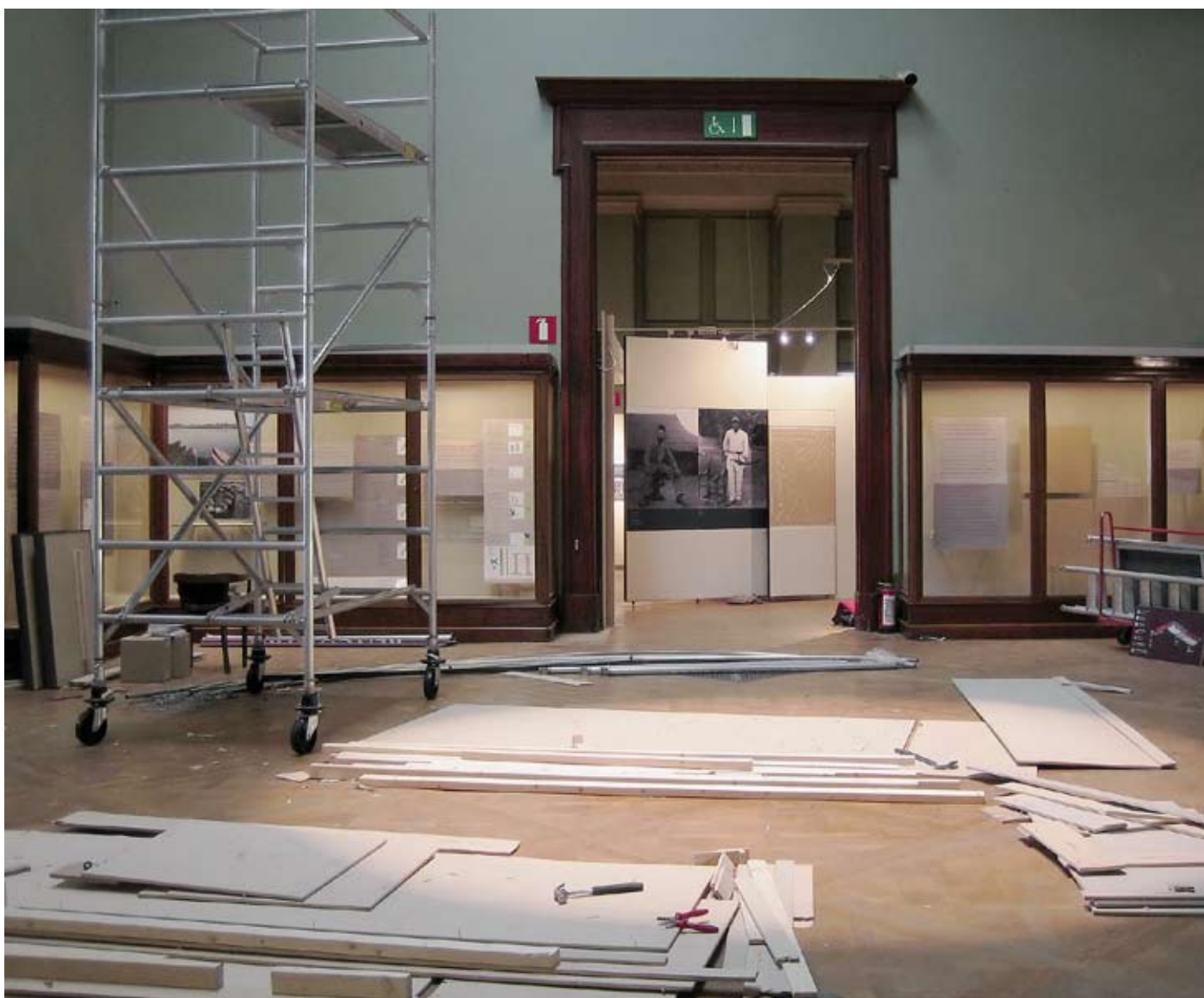
Peggy Buth, Desire in Representation , 2004–2009 Series of 70 photographs