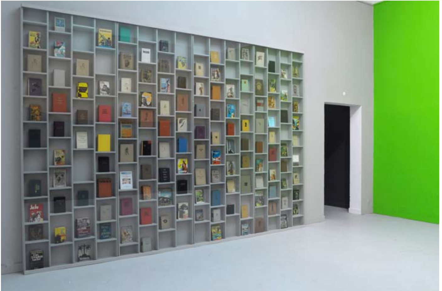
Peggy Buth, Untitled (library) , 2009 Mixed media installation Dimensions variable Exhibition view WKV, Stuttgart