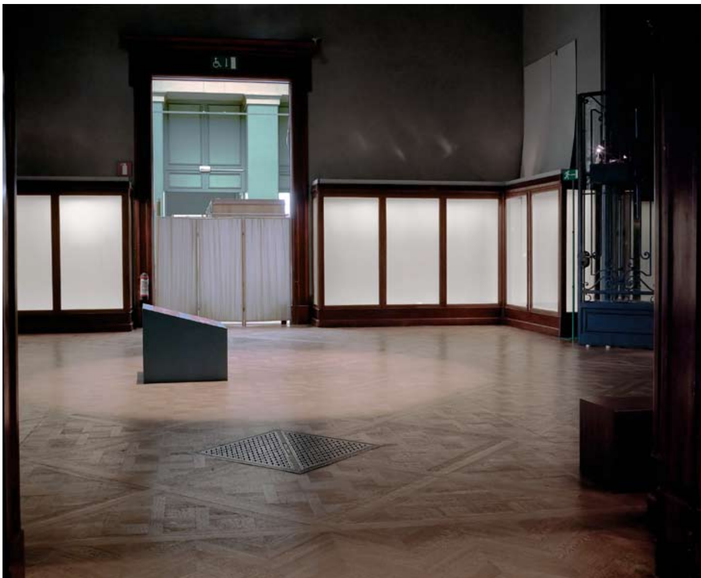
Peggy Buth, Desire in Representation , 2004–2009 Series of 70 photographs