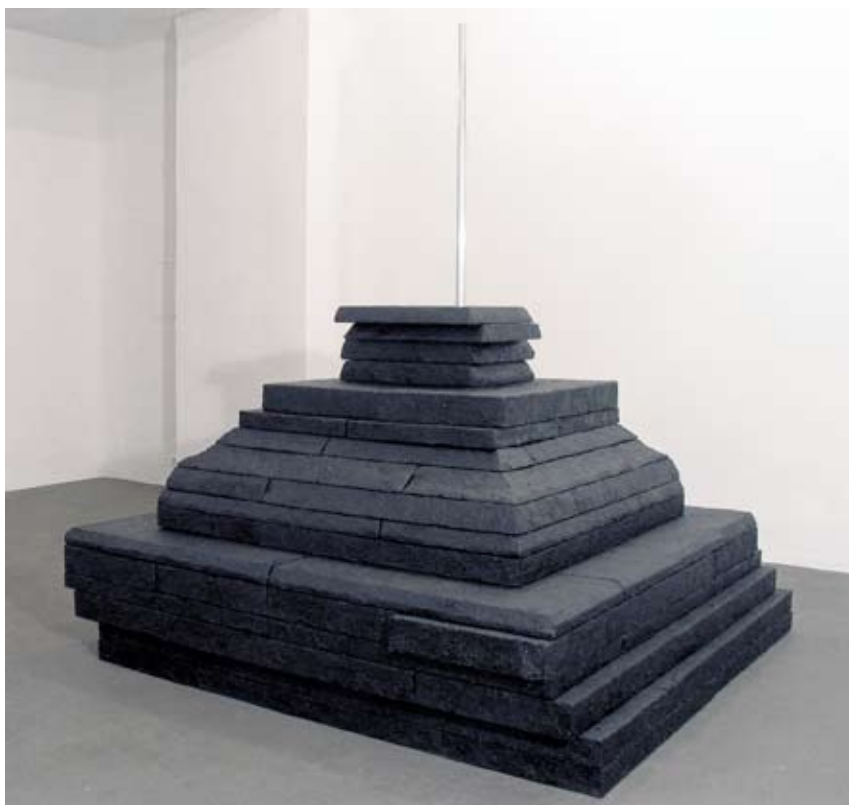
Peggy Buth, Monument , 2005