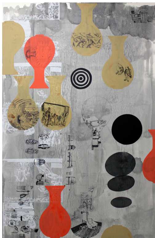
Photo: Alexandre & Florentine Lamarche-Ovize Private collection, Paris