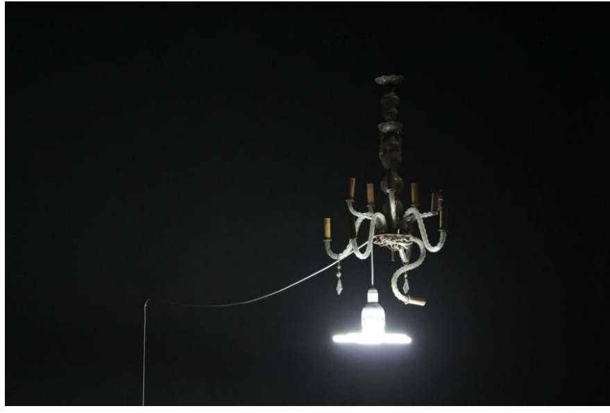
Courtesy the artist and Anne Barrault, Akinci, Grey Noise and Marfa' galleries

Re-Enactment is centred around objects fabricated by others, that the artist reproduces. Encountered by chance in different places, the chosen objects escape standardization. They have been conceived according to a strange logic, different from the artist's own logic. Through the process of reproduction, this foreign logic is understood and appropriated. The re-created objects surpass practicality. They access new layers of meaning, and raise questions about the cultural aesthetic they are the results of, or not. Re-Enactment generates a slow collection of unimportant, neglected objects, which quickly disappear otherwise. Their lives become longer.