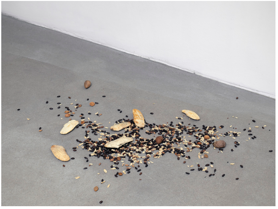
Courtesy the artist, Akinci, Anne Barrault, Grey Noise and Marfa' galleries