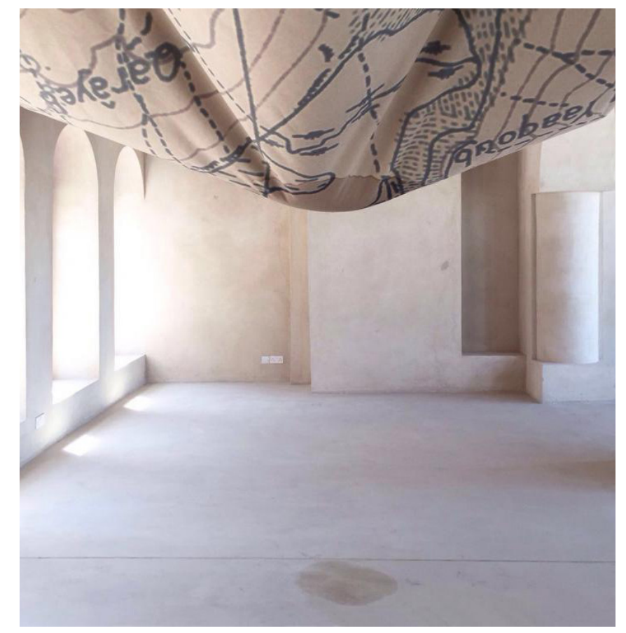
Courtesy the artist, Sharjah Art Foundation and Akinci, Anne Barrault, Grey Noise and Marfa' galleries

Portrait of a Lake consists in a suspended piece of map. It shows us the outlines of a lake and its surrounding grounds, now hanging above us. As water pours on it, the representation of the lake, dating back from 1938, becomes humid again; the lake is reactivated. As it crosses the representation of the lake, water becomes water from the lake. Dripping down onto the floor, it slowly draws the outlines of the lake anew; A self-portrait, drawn by the lake itself. Yammoune Lake is a "pull-apart": a void constituted