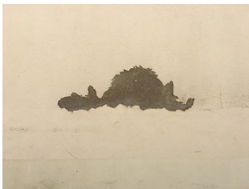
Trails in Nevers