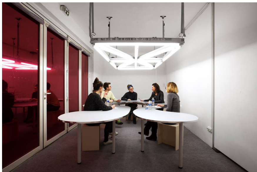
Le seul possible et l'échec, 2017 Participatory installation, various materials © Isabelle Giovacchini

Their collective work has been shown during the solo show « Le seul possible et l'échec », Glassbox, Paris, in 2017 and Le langage de l'événement has been experimented in 2016 during the Printemps de Septembre, Toulouse and the « Museum On/Off », Centre Pompidou in Paris.