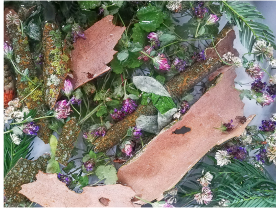
© Géraldine Longueville Plants being prepared in order to produce a beverage.