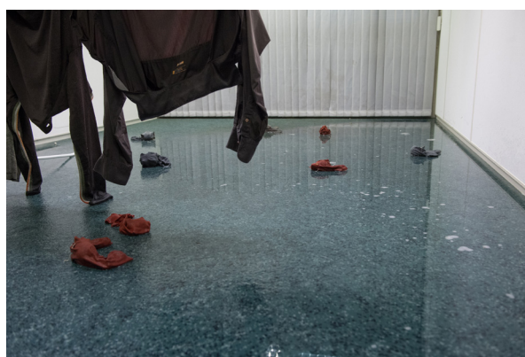
WArmNAssKAltTrocken, 2018 Detail Shirt, socks, potato, waters Variable dimensions