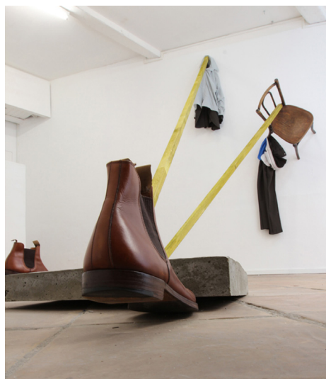
None to high, 2014 Shoe, concrete, wood, clothes, chair Variable dimensions

©Eric Hattan Courtesy Galerie Espace pour l'art, Arles