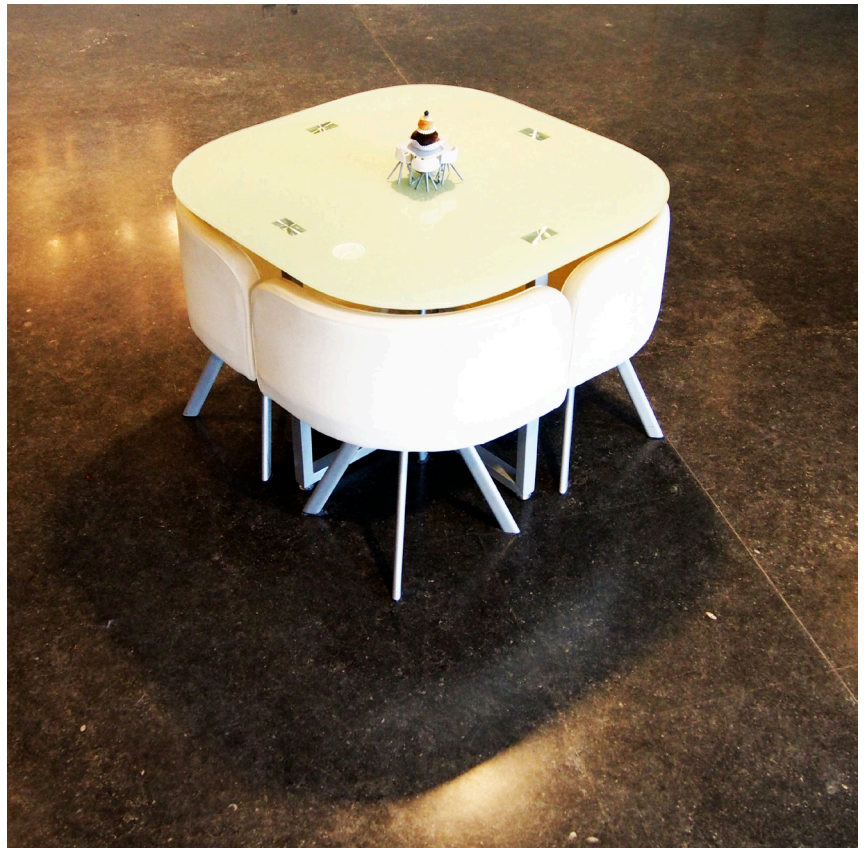
Salomé , 2015

The works presented in the exhibition have been produced with the support of Thomas Plasschaert workshop.