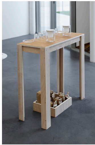
Les eaux - médiation, 2016-2017 Exhibition view « Jump », CAC Brétigny, 2016-2017

She starts, in 2014, a collaborative art and gastronomy production workshop named Black Garlic, which have organized some dinners in various places, amongst which La Galerie, Noisy-le-Sec, in 2016-2017 or the CAC Vilnius in 2015. As part of her research about the beverage, its use and its power of transmitting, she produced some performances, drinks or poems such as A State of Water , Bétonsalon, Paris, and Three States of Water at the PAKT, Amsterdam, in 2017, Les eaux – médiation , CAC Brétigny in 2016-2017 or even The Companion , Liverpool Biennale in 2014.