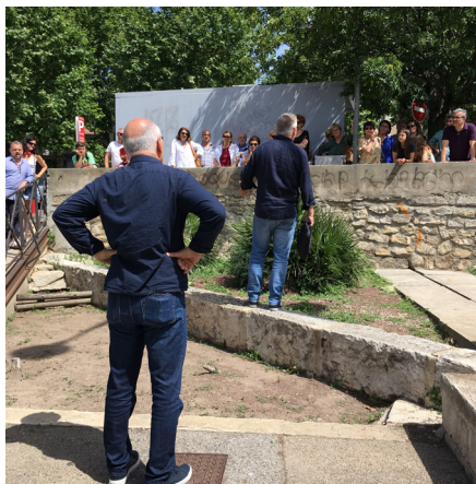
On sait la chance qu'on a, 2018 Performance, Arles